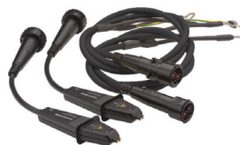
+ DH4-C probe 1.5 m leads