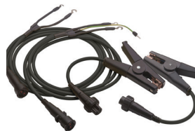
+ KC1 Kelvin clip 3 m leads