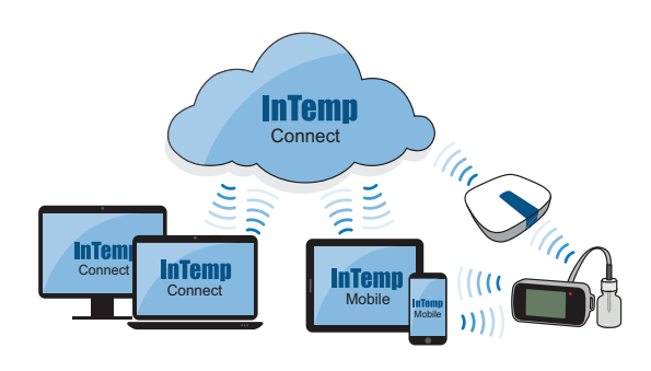
Upload Data from the Logger to the Cloud via the Gateway

Tip: If you need to add a user, click the Users tab and then Add User, fill in the fields, and assign the user a role with gateway privileges.