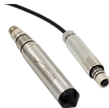
Detachable Cable Option