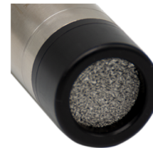
Piezometer Nose Cap