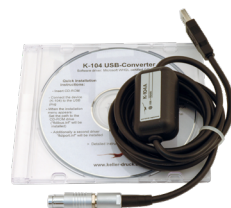
Interface Converter (RS485)