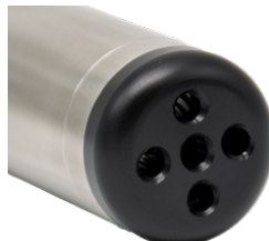
Open-faced Nose Cap