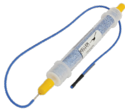
Drying Tube Assembly