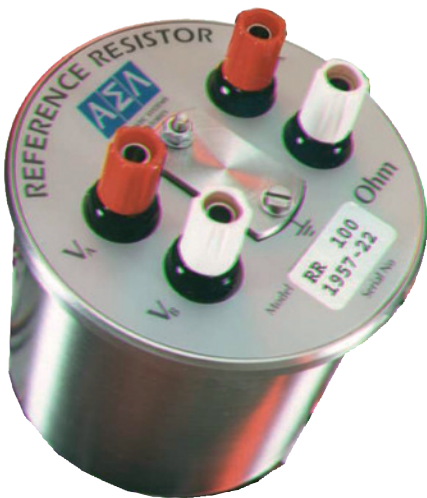
Model CER6000-RR reference resistor with 100 Ω