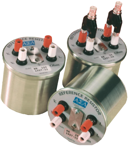
Model CER6000-RR reference resistor with different resistance range