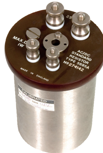
Standard reference resistor, model CER6000, 10 \Omega