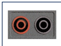
Jacks: Two standard safety banana jacks (4mm)