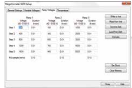
Model 5070 includes Ramp Function which allows programming of three different ramp test profiles, each containing up to five voltage steps between 40 and 5100V and time per step of up to 10 hours.

Test result status box displays complete test results in real-time