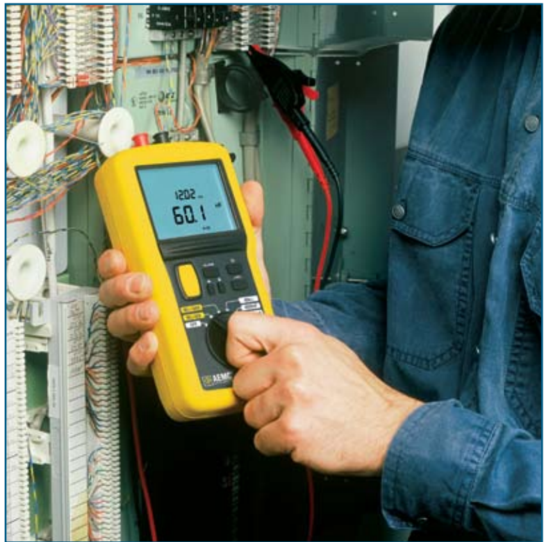
Safety rated 1000V clips provide quick and easy connection of test points for the Model 1039.