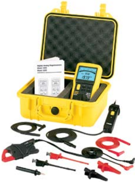
Model 1039 Field Kit, Catalog #2115.43