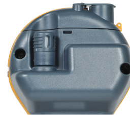
Quikstick ST POL8751, standard with all MMS3 kits and with the same performance as the standard Quikstick. A Quikstick ST can remain connected to the MMS3 while using the pins.

Readings from multiple Hygrosticks can be taken and recorded with ease. Humidity readings can be taken with the use of humidity sleeves or humidity box. Hygrosticks, not Humisticks, should be used for this test.