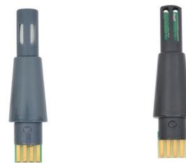
Hygrostick part number POL4750, for high moisture applications.