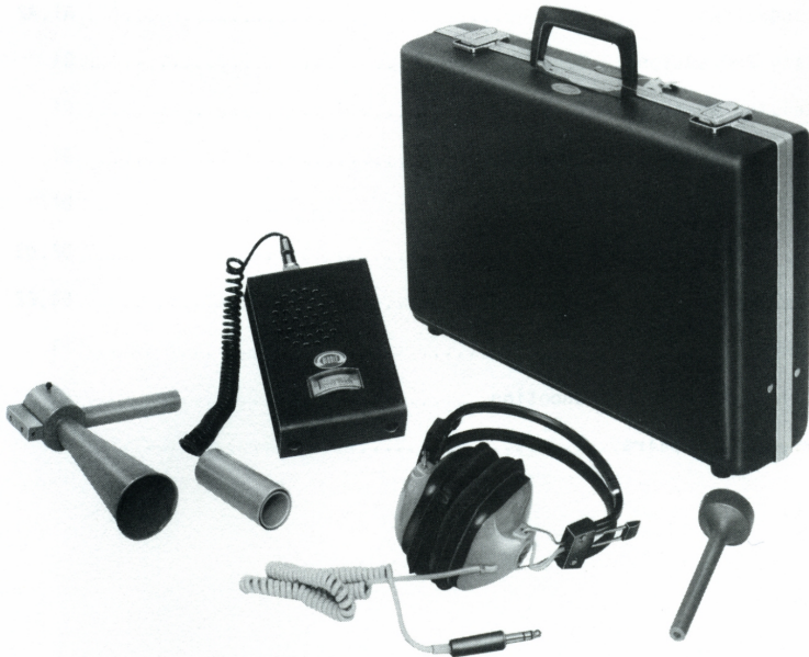
FIGURE 1: ULTRASONIC CORONA AND LEAK DETECTOR CATALOG NO. 569001