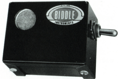
FIGURE 2: ACCESSORY ITEMS.