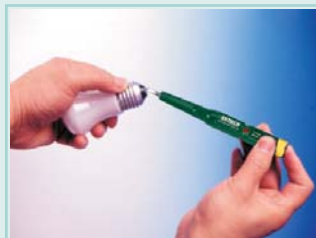
Light Bulb Continuity Check