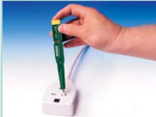
Voltage check in an outlet