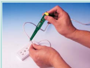
Checking for open wires in cables