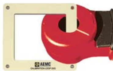
Calibration Check Loop (included)