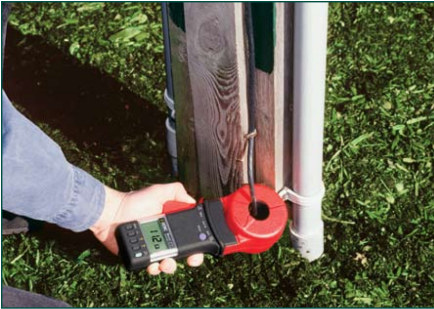
Model 3731 performing a ground rod resistance check.

The Models 3711 and 3731 measure ground rod and grid resistance in any environment without the use of auxiliary ground rods. Clamp-on ground resistance testers are used on multi-grounded systems without disconnecting the ground under test. The Models 3711 and 3731 simply clamp around the ground conductor or rod and measures the resistance to ground fast and accurately.