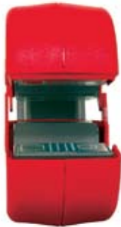
The smooth head surface eliminates build up of foreign particles and improves reading accuracy.

The ergonomic body design permits one-handed operation. The guard provides additional strength, and prevents the hand from slipping or coming into contact with conductors under test. The LCD lens cover may be easily replaced if scratched. The sealed push-buttons directly access all test functions and are easily operated even with gloved hands.